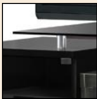
Elevated glass top