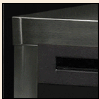
Stainless steel firebox enclosure

Elevated above a modern stainless steel firebox enclosure, the sturdy, smoked-glass top creates a sleek display space for the latest wide-screen TVs. Black lacquered cabinets, accented with smoked-glass doors, provide ample room for storing equipment, DVDs and other essentials.