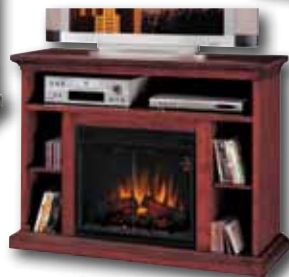
Premium Cherry 23MM374-C202

Mantel Dimensions: 48”w x 17”d x 35”h Used with: 23EF025GRA Electric Fireplace Insert