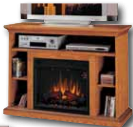
Premium Oak 23MM374-O107